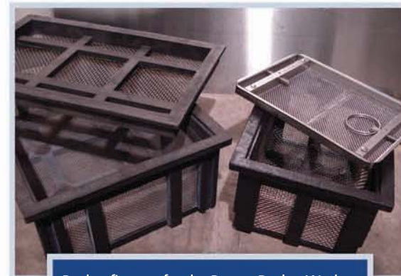
Basket fixtures for the Rotary Basket Washer.