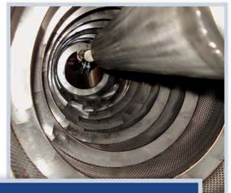
Internal view of FMT Rotary Drum Washer.